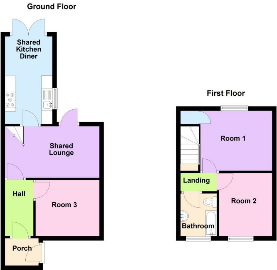
19 Fair View, Barnstaple